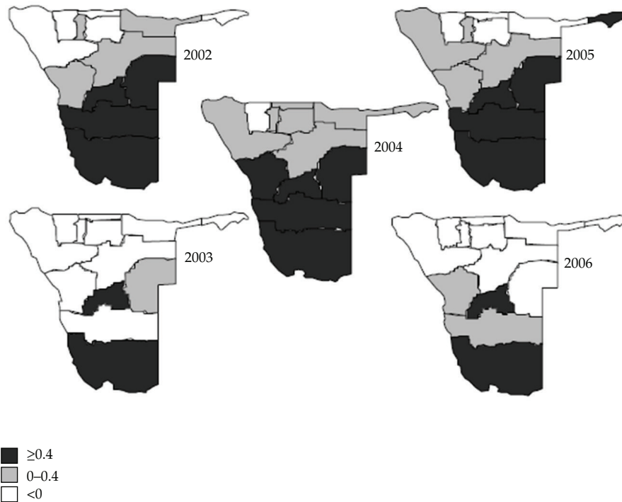
Figure 2: Distribution of the posterior mean value for the space-time structured heterogeneity ( u_{rt} ) onto study regions.

mean estimates of the time trend component displayed in Figure 3 indicates that although there is an overall steady increase in the temporal trend over time, the trend appears to be very smooth.