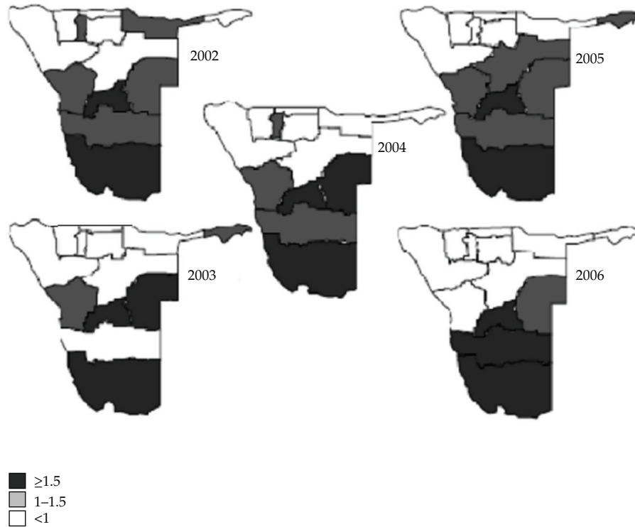
Figure 4: Crime maps of the posterior mean estimates of the relative risk ( \lambda_{it} ) of murder.

municipalities, security companies, and individuals amongst others have spent considerable efforts and resources on measures pertaining to the reduction of murder in the country, less effort on understanding the contributing factors to the increase in the relative risk of crime has been achieved. In particular, the reported rate of murder per capita which put Namibia among the highest nation in the world needs a further understanding if it is to be reduced or managed to a lesser level. In doing so, the paper adopts an application of the FB approach, which comprehensively evaluates uncertainty in the unobserved random effects contributing to the variation in the space-time regional relative risk of murder. The evaluated random effects include regional clustering (space-time structured heterogeneity), unstructured heterogeneity, time, space and time interaction, and population density.