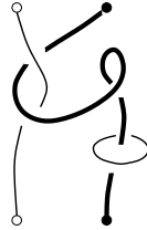
Figure 1: Diagram of a two colored tangle